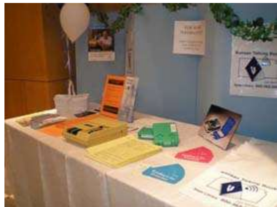
Topeka & Shawnee County Public Library set up a display table in the rotunda for Talking