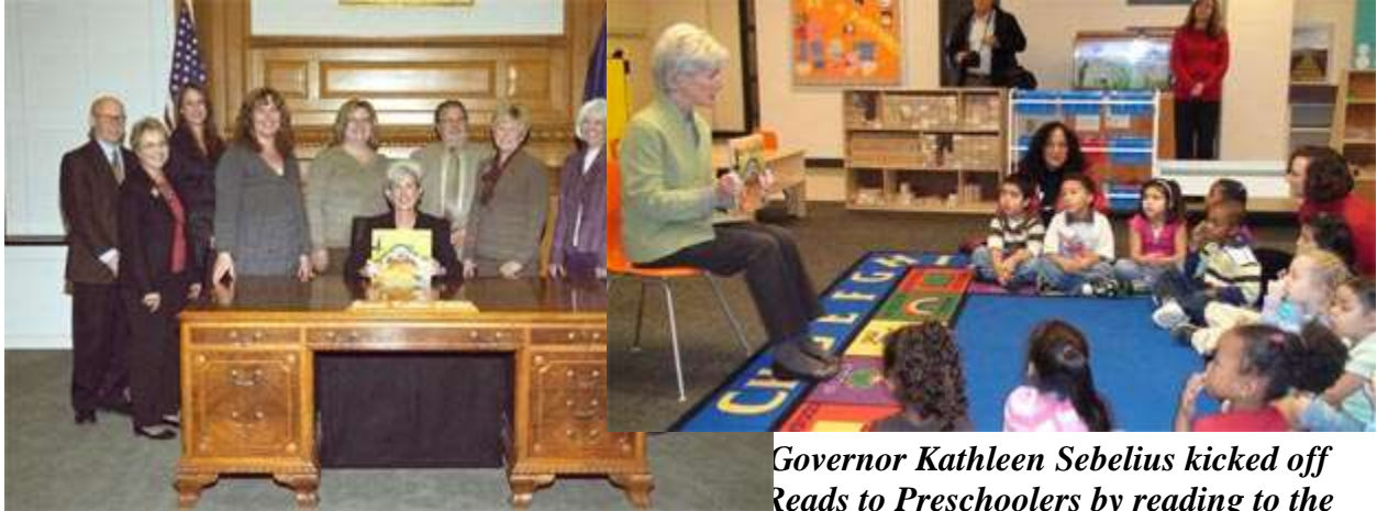
Governor Kathleen Sebelius kicked off Reads to Preschoolers by reading to the preschoolers at Topeka Salvation Army Proclamation Signing in the Governor's Office November 14, 2008